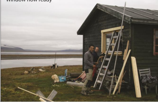
Window now ready