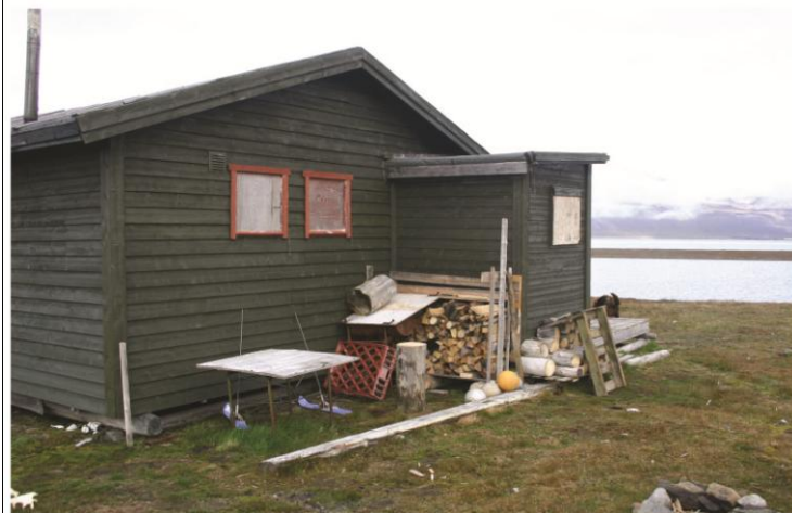
Fire wood - more at the beach!